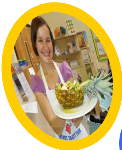
Cook up a storm

Here are some of our supporters in action!