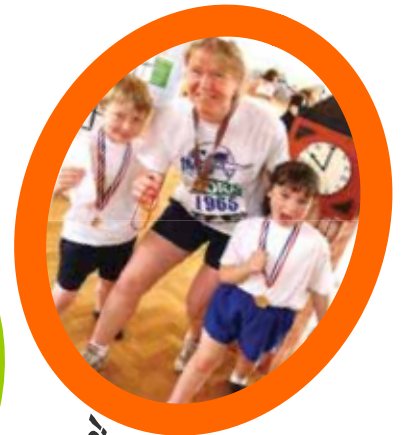
Ready, steady, go!