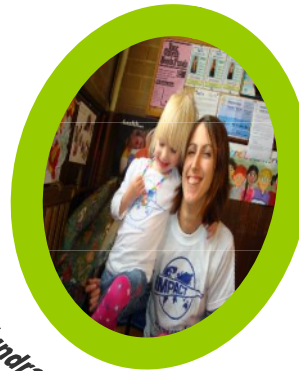
Involve the whole family